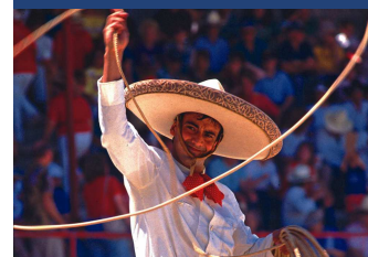
Enjoy the sights and sounds of San Antonio