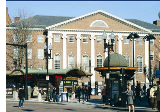
World-Renowned Harvard Square