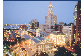
Faneuil Hall Marketplace