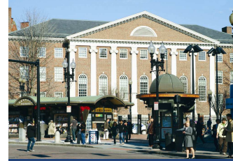
World-Renowned Harvard Square