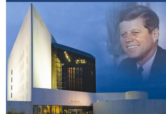
JFK Library & Museum